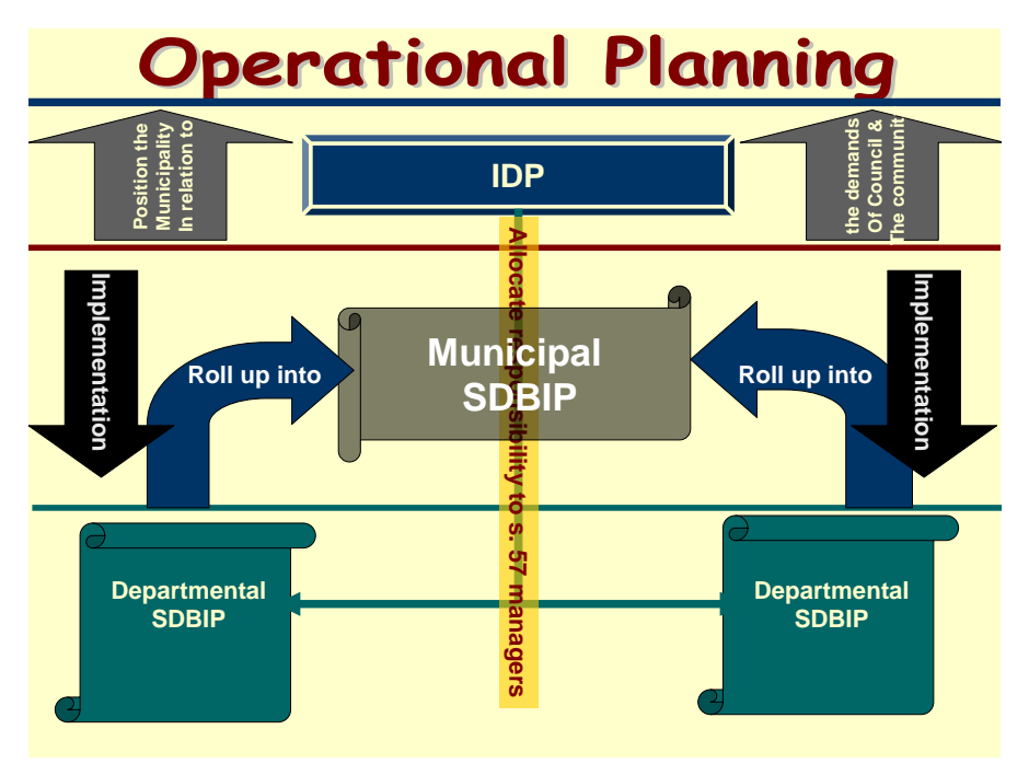
Figure : Perspective on the relationship between the IDP, SDBIP and Departmental SDBIPs

The approach that has been taken with the compilation of the SDBIP is as follows: